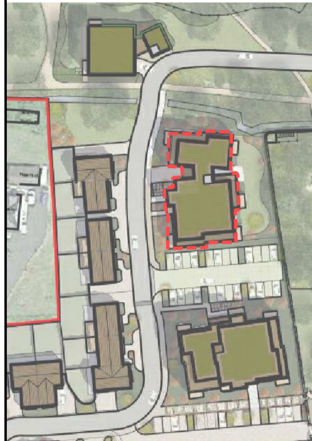
KEY PLAN INDICATING POSITION OF APARTMENT BLOCK 6 NOT TO SCALE