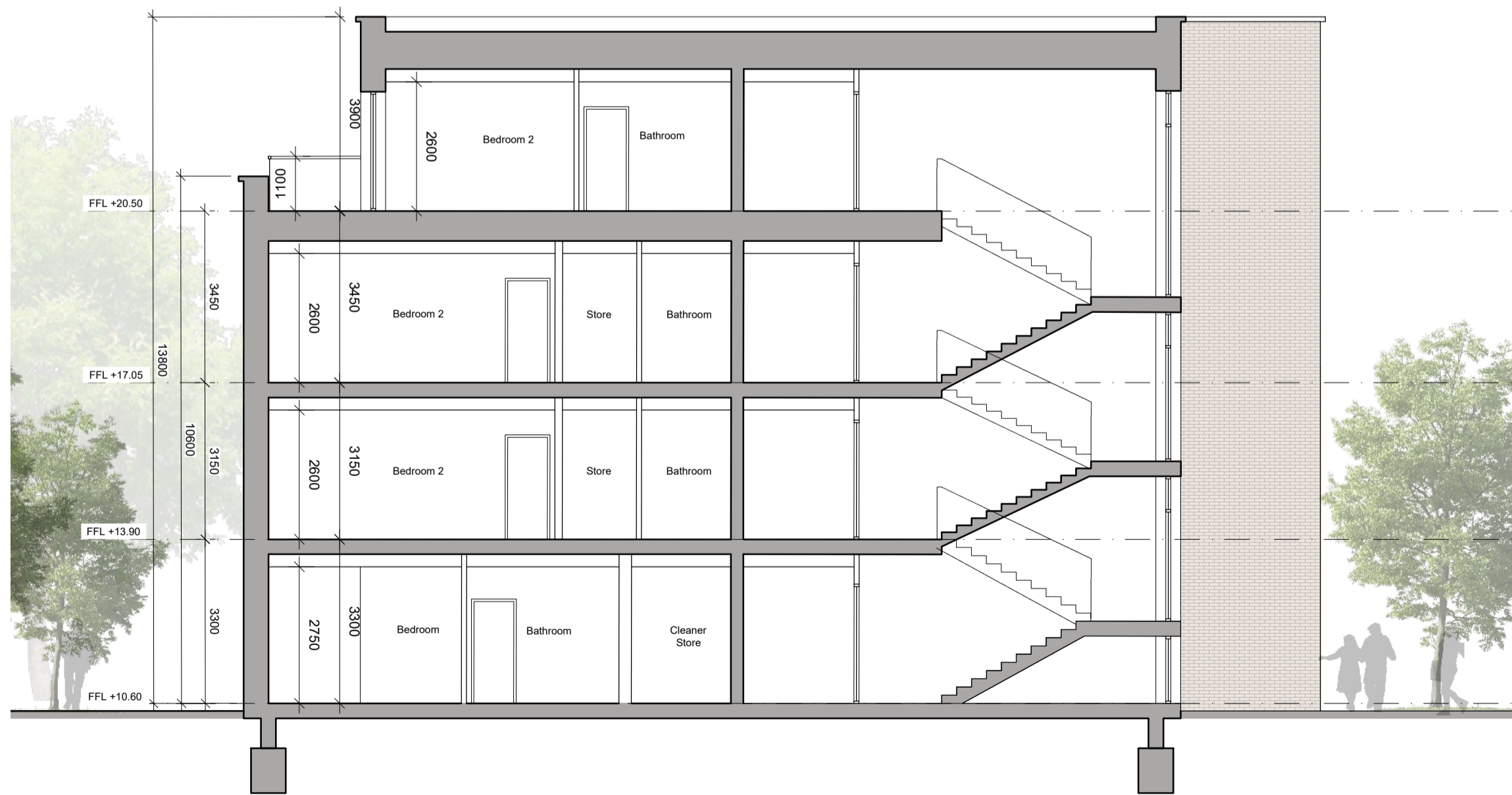
BLOCK 6 SECTION A-A SCALE: 1:100