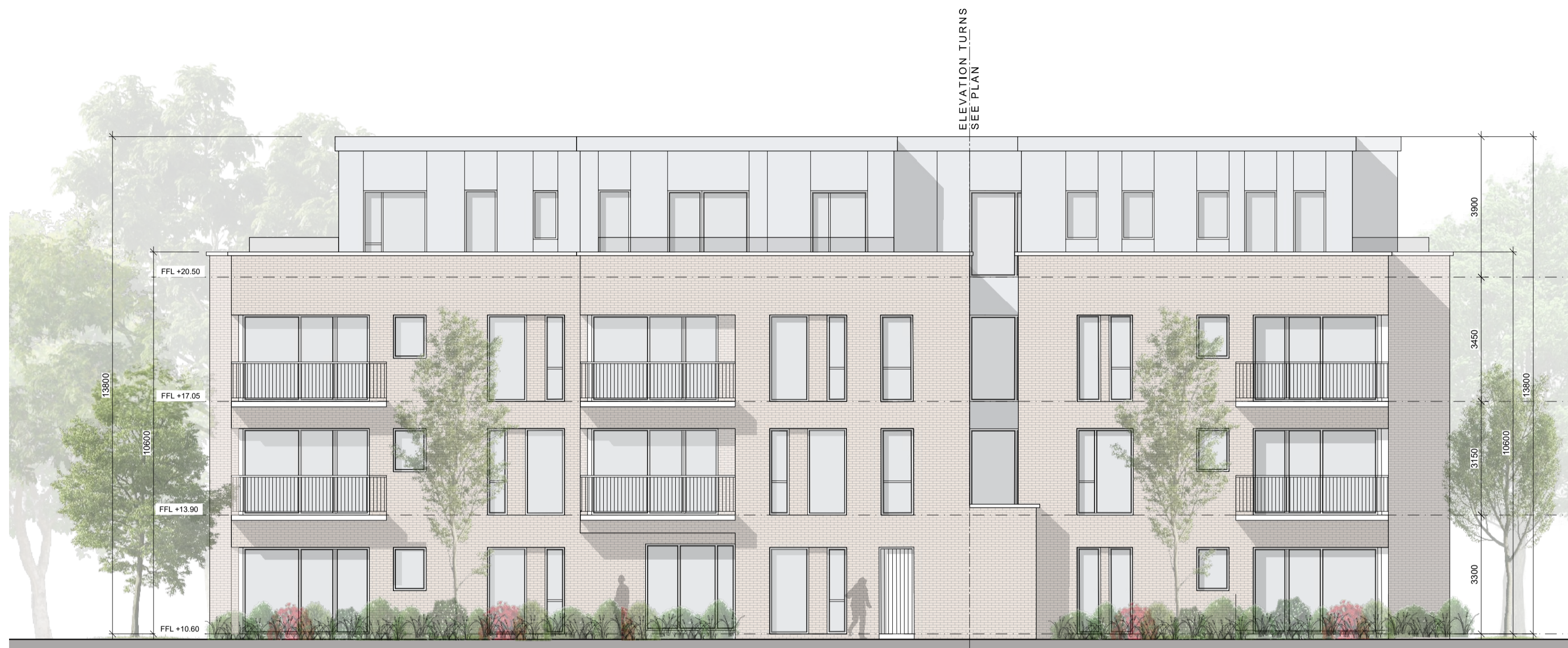
BLOCK 6 EAST FACING ELEVATION SCALE: 1:100 MATURE PLANTING BEYOND SHOWN INDICATIVELY.